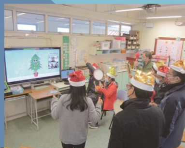
網上聖誕聯歡會 Online Zoom Christmas Party