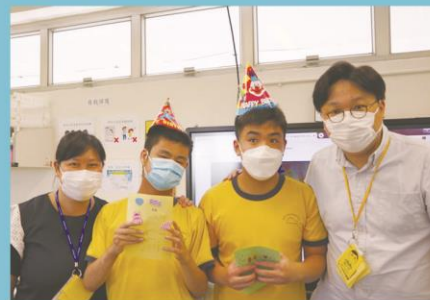
秋季及冬季生日會 Autumn and Winter Birthday Party