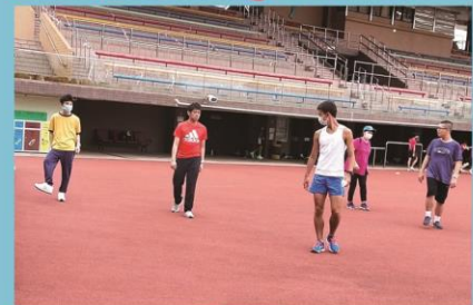
2020-2021年度 香港教育大學周年越野跑 The Education University of Hong Kong Annual Trail Running 2020-2021