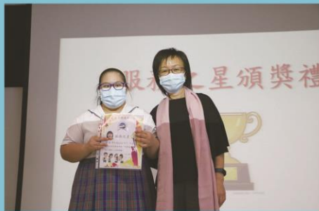
服務之星頒獎禮 Award Presentation Ceremony of "Service Stars"

In light of the situation of the COVID-19 epidemic, the school resumed face-to-face classes on a half-day basis in late-September and suspended them again in December. Despite the short period of face-to-face classes, students took part in various activities!