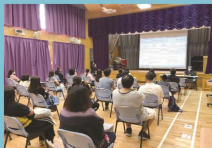
家長日 Parents' Day

Our student joined the cooking competition organised by Hong Chi Morninglight School, Tuen Mun. His dish is Rainbow Biscuits.